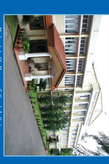
Rajagiri College of Social Sciences